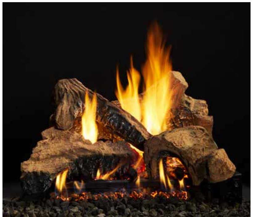
Duzy 2 - 24" Log Set