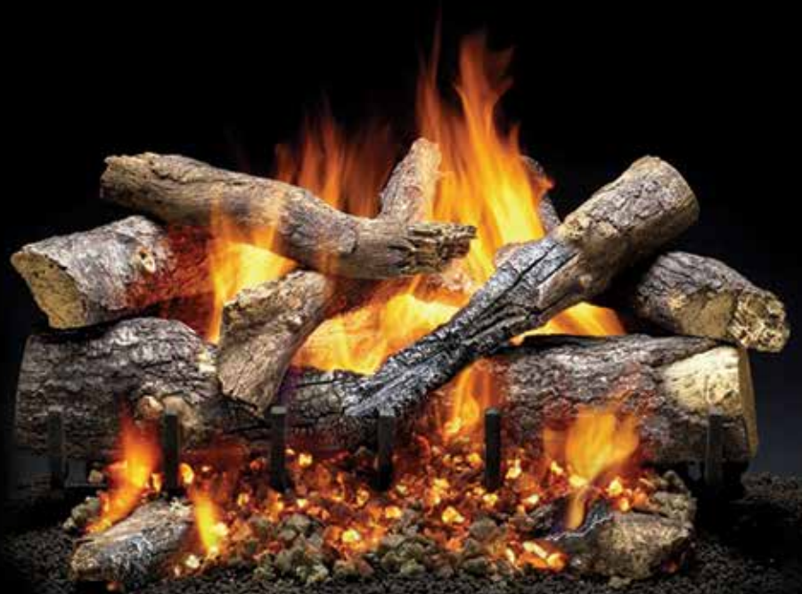
Grand Oak 24" 2-Tier Log Set

For larger fireplaces, the Fireside Grand Oak vented gas log set showcases 11-12 authentic logs from real oak timber molds. An ultramodern burner system creates a multi-level fire. The Outdoor version has such a beautiful fire, friends may ask if they can add a log to it. For gas logs with radiant burner technology, add outstanding realism with the Duzy 5's eight true-to-life ceramic logs, pushbutton ease and Natural Flame™ look.