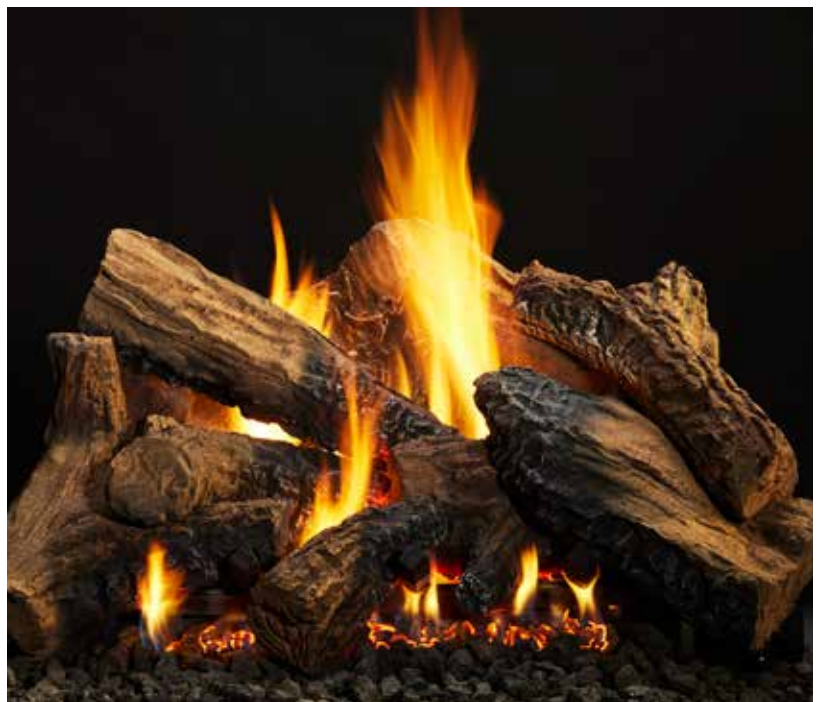
Duzy 5 - 24" Log Set