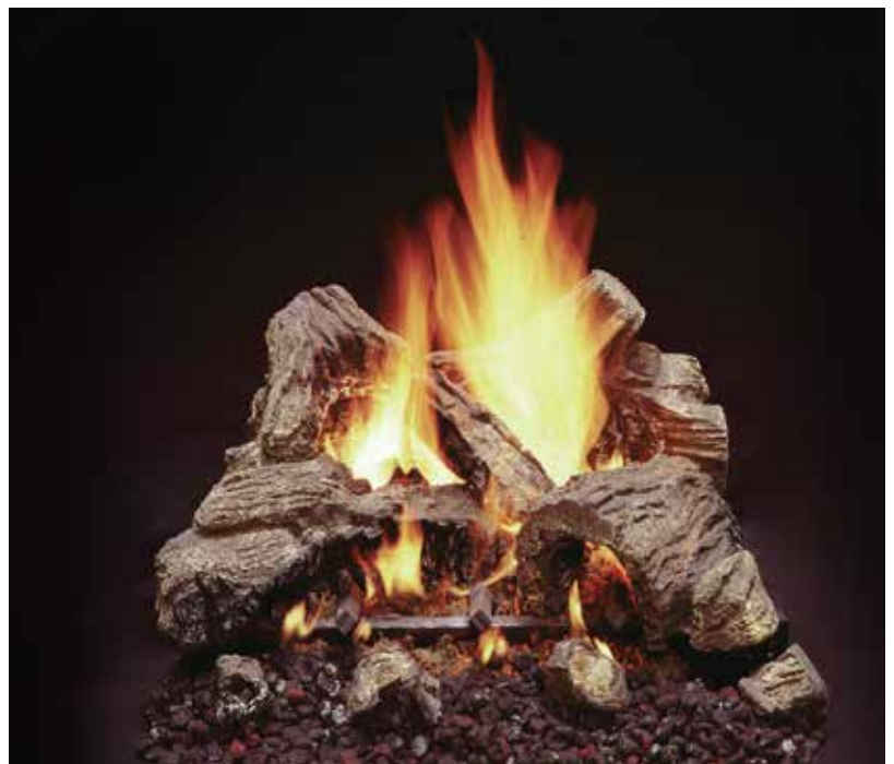
Duzy 2 - 24" Log Set