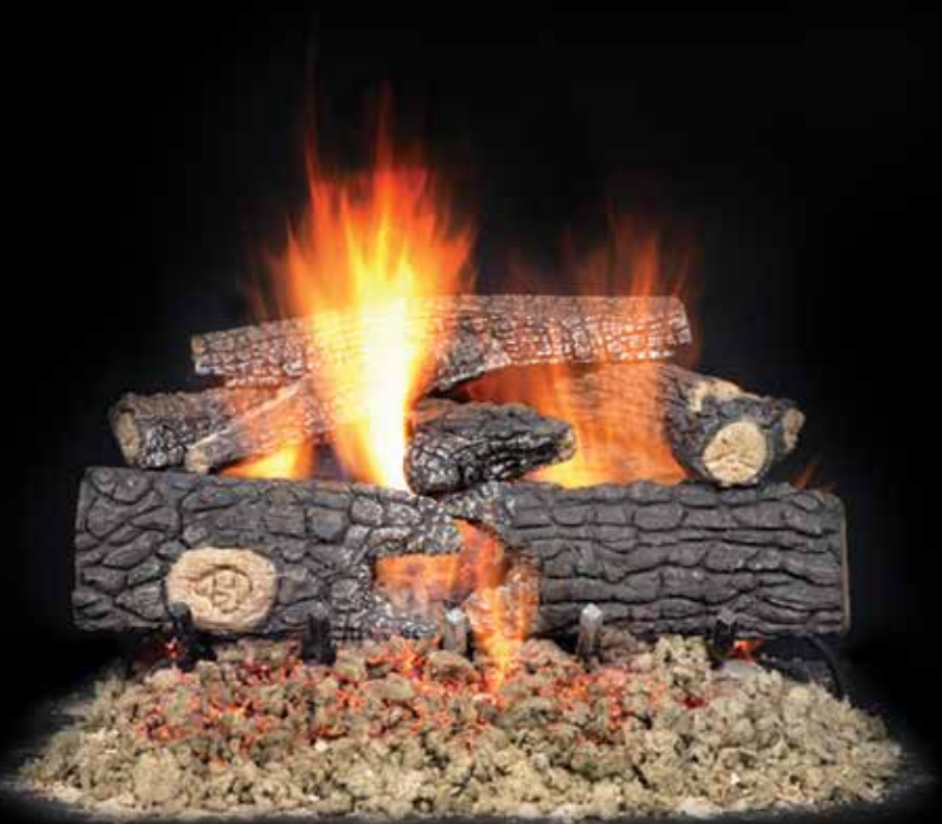
Fireside Realwood - 24" Log Set

Beautiful logs create a beautiful fire, but they don't have cost a lot. The Fireside Realwood gas log set adds bona fide appearance with eight detailed logs at a value price. An Outdoor model features a stainless-steel grate and burner elements to handle the elements. The Duzy 2 fits even narrow wood-burning fireplaces with four ceramic-fiber logs and our patented Natural Flame stainless steel burner, while the Campfire set recreates a natural look with 10-11 ceramic fiber logs.