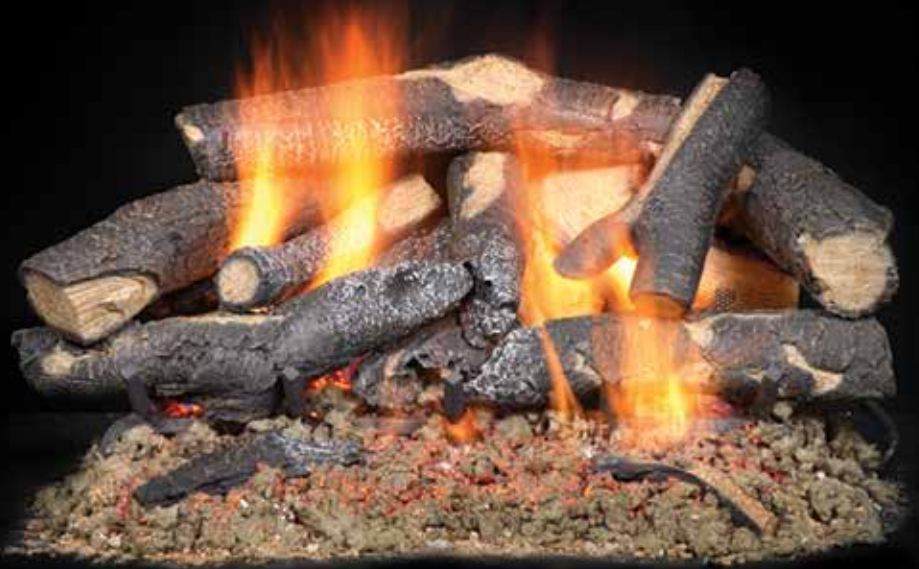
Fireside Supreme Oak - 30" Log Set

For a charred, mature fire, the 12-log Fireside Supreme Oak gas log set is stunningly realistic yet affordable. The detailed concrete logs, molded from real oak, are attractive even when not burning—also in a See-Through model that looks great from either side. In the Duzy 3, durable, glowing logs are convincing while radiant heat technology distributes penetrating warmth with no fan needed.