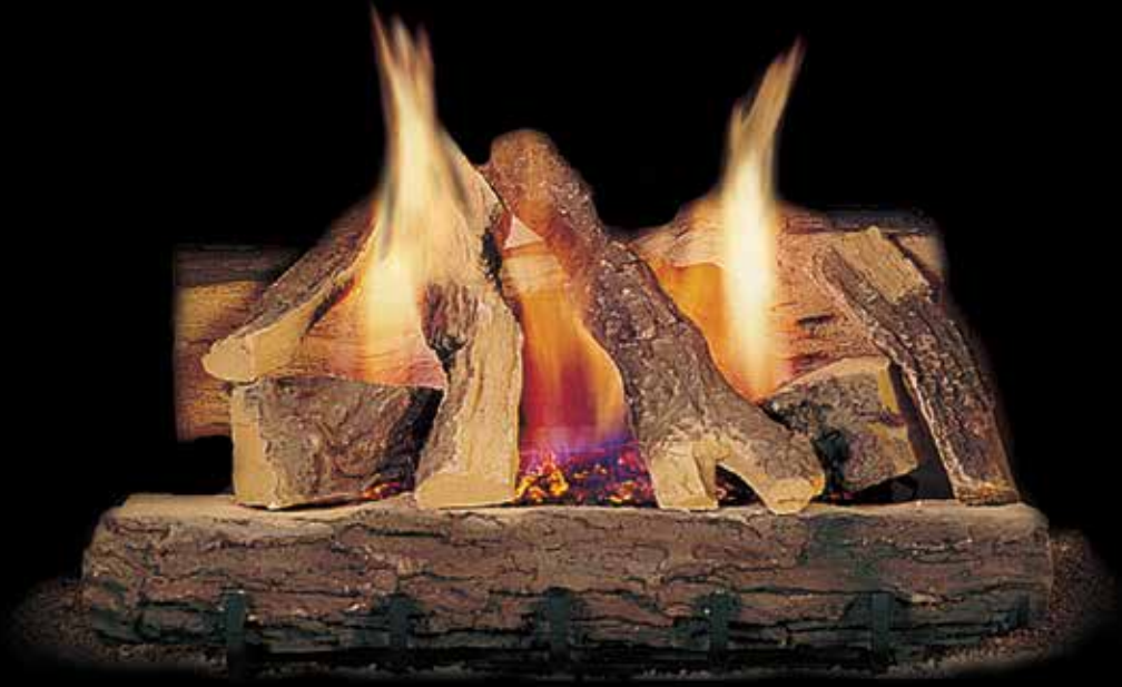
Campfire - 30" Log Set