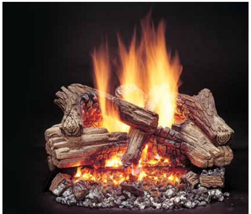
Duzy 3 - 24" Log Set