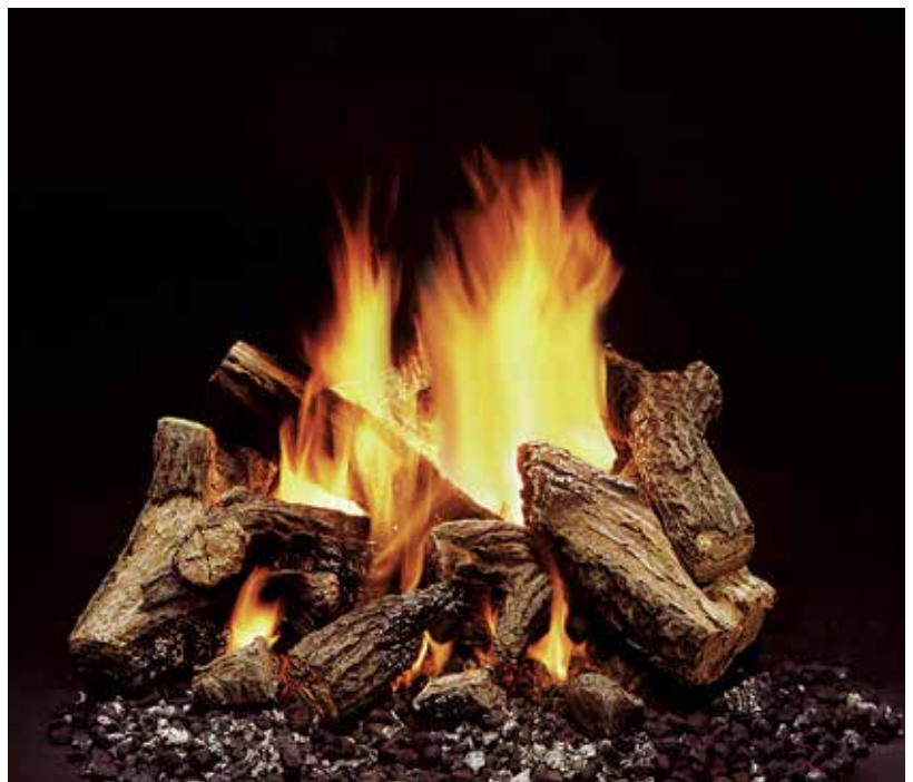
Duzy 5 - 24" Log Set